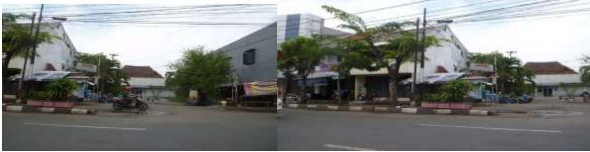
Figure 11 The entrance to Kampong Leduwi, M.T. Haryono street

has a "Y" shape. There is a "delta" area, an area which is inhabited by the "Toean-tanah" (Land-lord) a rich people who owned the land surround the delta, include many retail shop on the main M.T. Haryono (Mataram) street. In the classification of Greertz, the inhabitants of Kampong leduwi can be classified as the "Abangan" 7 community.