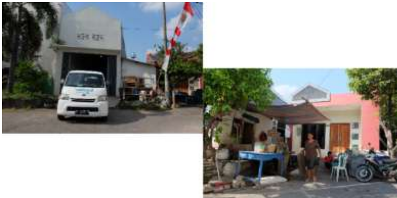
Figure 10 (Modern) Housing @ Kampong Leduwi