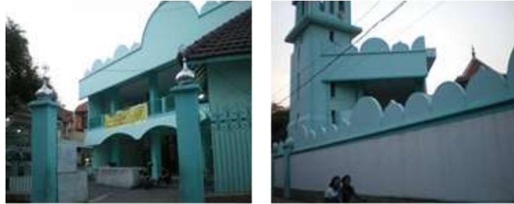
Figure 6 : the mosque of Petolongan