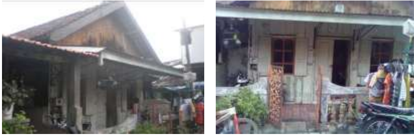
Figure 8: houses in Petolongan old district