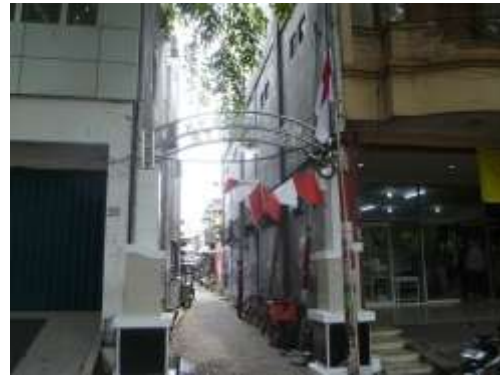
Figure 1 : The gate to Kampong Bustaman