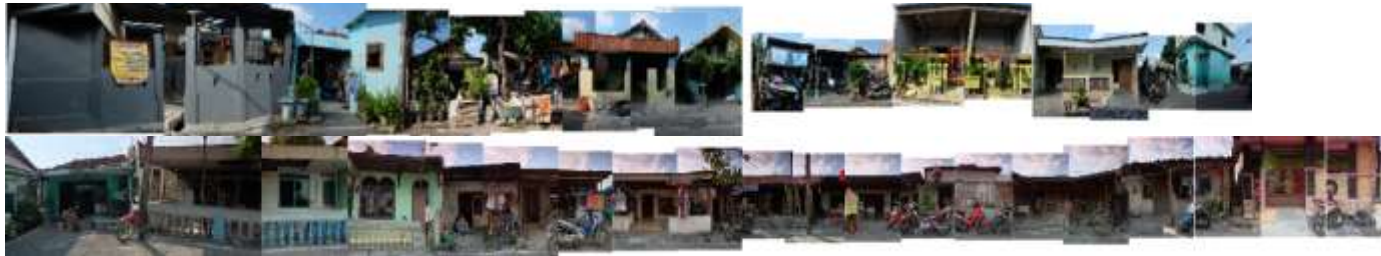
Figure 12 : Silhouette of houses @ South Kampong Leduwi

In comparison with Kampong Bustaman and Kampong Kulitan which have a classical vernacular architectural style, Kampong Leduwi housing architecture has been always up-dating to the latest fashion and the latest new-material although in the context of the lower income class purchasing-power.