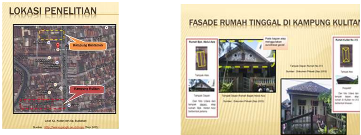
Figure 4 : Layout of Kampong Bustaman & Kulitan

Kampong Kulitan and Kampong Bustaman known as ancient Kampong which had a very significant roles in the establishment of Semarang city. In the history of the establishment of Semarang city, many traders from many countries came to Semarang to trade. Those newcomers built their shelters and markets as places for trade. There are several historical relics especially in the sectors of architecture in the form of residences in Kampong Kulitan and Kampong Bustaman in Semarang City 5 . There we can find that the architectural visual character on the exterior of the building facade or existing dwelling of residences in Kampong Kulitan and Kampong Bustaman, Semarang, had been influenced by the architecture visual character of the Dutch, Arabic, Chinese and Javanese buildings. It can be seen from the use of Netherlands typical roof (Mansard roof) and Chinese typical roof ( Hsuan Shan roof), at the opening of the doors there were 3 pieces taken from Arabic architecture that symbolizes Islam, Iman, and Ikhsan. Besides, Arabic architecture also appear on a console that has a plastic curved shape, and the details and listplank adopted using floral motifs typical of the Javanese architecture 6 .