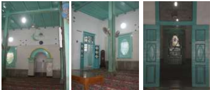
Figure 7 Interior of the Mosque