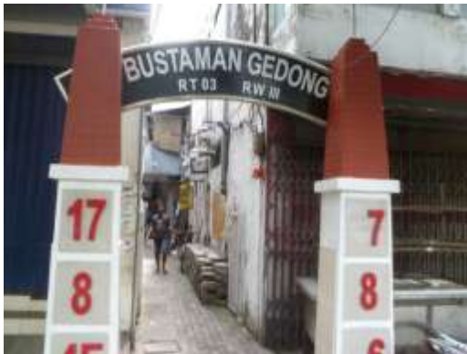
Figure 2 : The gate to Kampong Bustaman Gedong